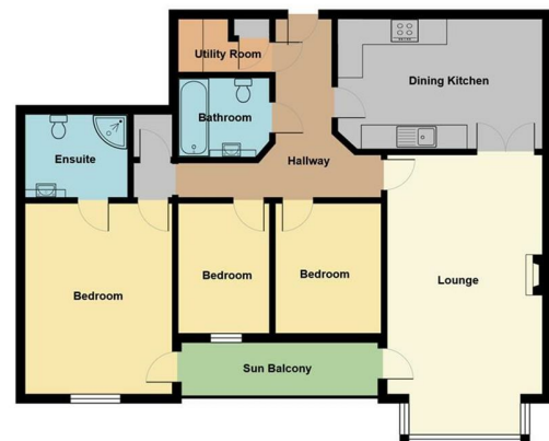
35, Palmetto View, Poachers Trail, Lytham St Annes, FY8 4FF

Total Area: 104.0 m 2 ... 1120 ft 2 (excluding sun balcony)